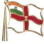
Admiral R Hari Kumar P/SM, AV/SM, P/SM, ADC Chief of the Naval Staff